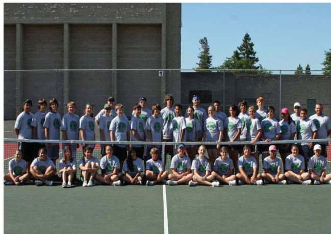
2010 Junior Camp group photo