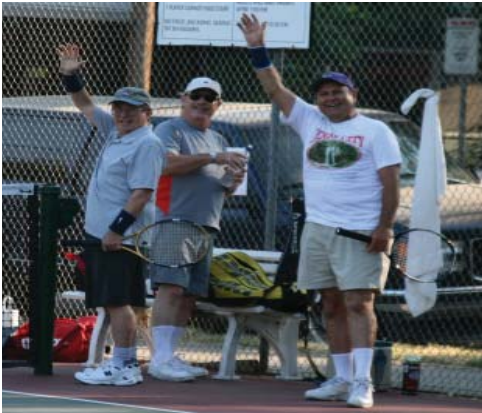
A happy group!